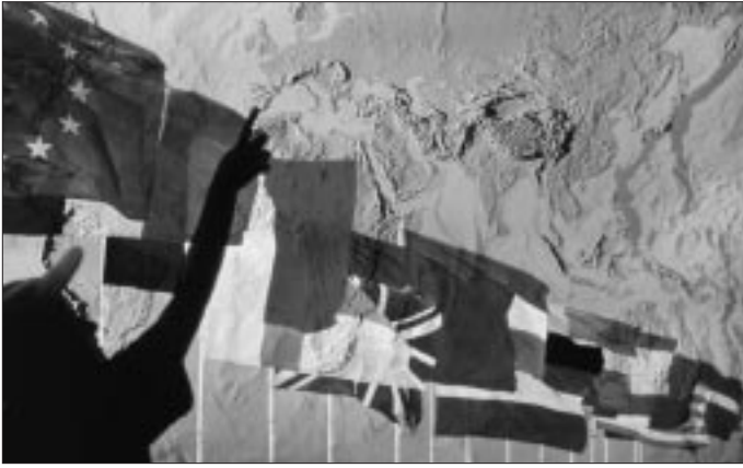
Flags of the European Union

buffer zone on the eastern borders of the EU.