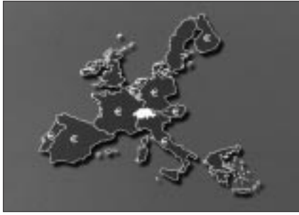
Map of the EU highlighting 11 countries currently in the single currency group—"euroland"

For centuries, Germany has been at the center of European affairs. Today, Germany has regained this status within the EU. It has large and powerful industries. The Deutsche Bank, which took over the New York Bankers' Trust and is now merging with the Dresdner Bank, comprises probably the largest and most powerful financial institution on the face of the earth.