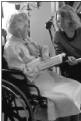
The number of people aged 65 and older will double in the next 30 years

Finally, a burgeoning senior citizen population promises persisting disputes over Social Security, Medicare, Medicaid and programs to ensure reasonably priced prescription drugs. Those aged 65 and older currently make up 12.7 percent of the population, or 34.4 million people. The Census Bureau forecasts that the figure will double in the next 30 years!