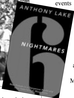
Anthony Lake’s book warns of anthrax being released in a crowded stadium

warning that I hope could in some small way stimulate action in our society and our government” ( Book Magazine , November/ December 2000).