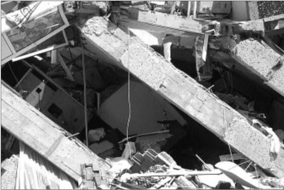
Devastating earthquakes topple concrete buildings like a house of cards

of rich nations, descendants of ancient Israel, that will not be able to rely on their wealth in the Day of the Lord.