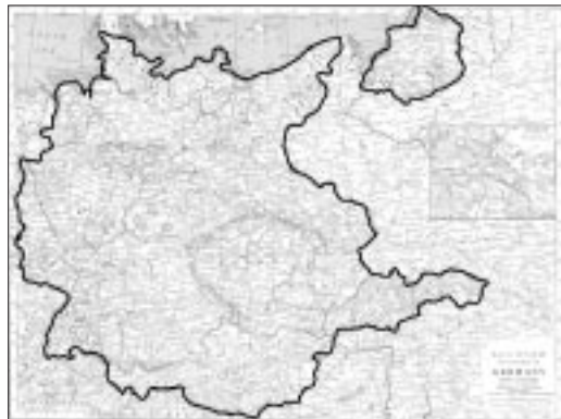
Germany pre-World War II