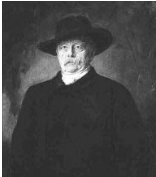
Otto von Bismarck, first chancellor of the German Empire (1871-90)

All six Germanys and previous ones were subject to what columnist Josef Joffe calls "the curse of geography." Geographical location has a profound effect upon national attitudes. The predominantly Anglo-Saxon countries are all protected by lengthy coastlines so that they do not have to greatly concern themselves with hostile neighbors. The result is a