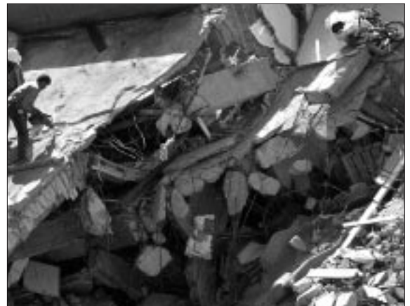
Digging through the rubble of an earthquake

What if, though, everything I described were reversed? Instead of most of us watching the events on television in comfort, what if most of us were experiencing the agony of a disaster? What if those nations that are now rushing to