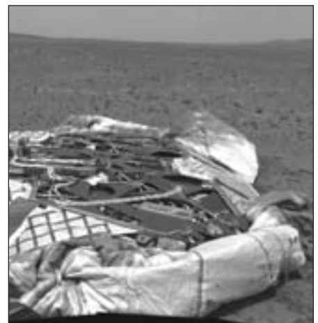
A photo from Mars Exploration Rover Spirit Jan. 21

Clearly the risks remain enormous, the costs astronomical and the required technology not quite yet fully existent.