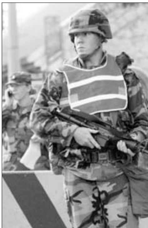
U.S. soldier stands guard at a U.S. Army base in South Korea. Troop reductions for South Korea were also announced in June.

Mr. Ferguson’s conclusions about the decline of American power are not new. Professor Paul Kennedy, another British historian who is now lecturing at Yale University, wrote his monumental best-seller The Rise and Fall of the Great Powers in 1987. In his book, Professor Kennedy studied “Economic Change and Military Conflict from 1500 to 2000” and concluded that the same trends that brought down the British, French and Spanish empires, would inevitably also bring down the Soviet and American