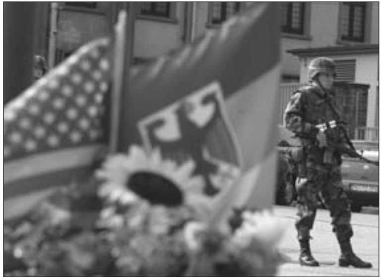
U.S. soldier stands guard in front of the Fifth Corps headquarters of the U.S. Army in Heidelberg, Germany. The Pentagon announced troop withdrawals from Europe in June.

"The first factor is the nation's growing dependence on foreign capital to finance exces-