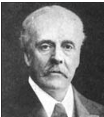
“The treatment of the [Jewish] race has been a disgrace to Christendom” (British Foreign Secretary Arthur James Balfour in 1904).

Almost everywhere one hears a message about how it is sometimes OK, (See “MARTYRDOM,” page 11)