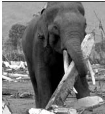
An elephant helps clear the debris of houses damaged by the tsunami in Banda Aceh, Indonesia.

God sometimes allow such devastation to take place, and what should our reaction be?