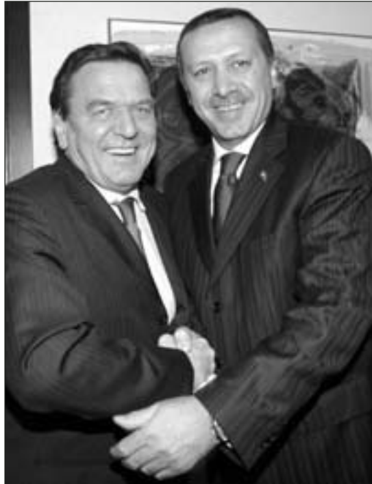
German Chancellor Gerhard Schroeder and Turkish Prime Minister Tayyip Erdogan pose before a meeting in Brussels, Dec. 16, 2004. EU leaders were poised to set a date to start accession talks with Turkey

Despite the undeniable progress Turkey has made in adopting European standards, the possibility of Turkey becoming a full member makes many EU leaders and citizens nervous. An interesting dichotomy has emerged between some EU