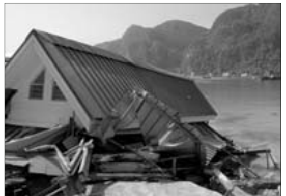
A damaged house on Phi Phi Islands in southern Thailand, Dec. 27, 2004, after a tsunami swept through this tourist resort

The irony of partaking of a delicious evening meal with close friends right in the midst of a monumental disaster half a world away was not lost on me. Feelings of guilt crossed my mind. But it was not until the early hours of the next morning,