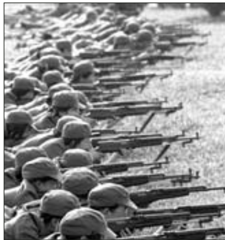
Freshmen of Zhongshan University take part in shooting practice during military training. All the first year university students in China are required to participate in military training.

A 1998 World Bank study found that 16 of the world’s 20 most polluted cities were in China, and that it is polluting not