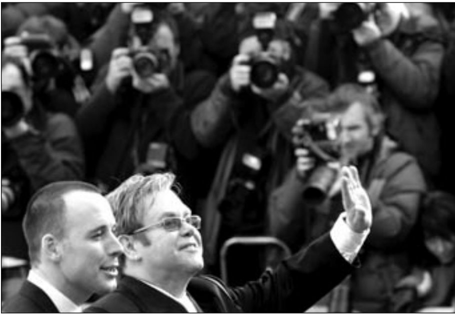
Press photographers shoot pop star Elton John and David Furnish after their civil ceremony in Windsor, southern England, Dec. 21, 2005.

(Hosea 8:7). What we do has unavoidable and terrible consequences later on!