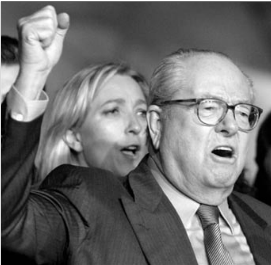
France's far-right leader Jean-Marie Le Pen and his daughter Marine take part in a National Front party demonstration criticizing the French government's handling of the urban unrest in poor suburbs of the Paris region and major provincial cities in Paris, Nov. 14, 2005. Mr. Le Pen has publicly stated his belief that George Bush is worse than Adolf Hitler.

collaborate willingly in the deportation to concentration camps of many thousands of French Jews.