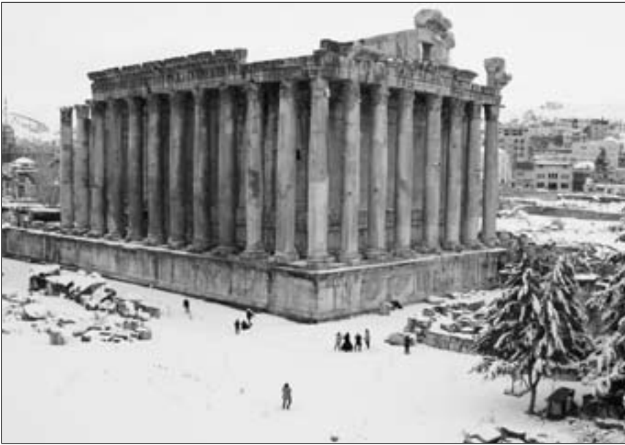
Ancient temple to the sun in the Roman city of Baalbek in the Bekaa Valley during a snowstorm Jan. 30, 2008. The book of Amos predicts dramatic events in this area in the end time.

same incident referred to in 2 Kings 13:7. “The metaphor Amos used is that of a threshing sledge, an agricultural implement made of parallel boards fitted with sharp points of iron or stone... The intensity of the metaphor, however, implies the most extreme decimation and may hint at especially cruel or inhuman treatment” ( Expositor’s Bible Commentary , note on Amos 1:3).