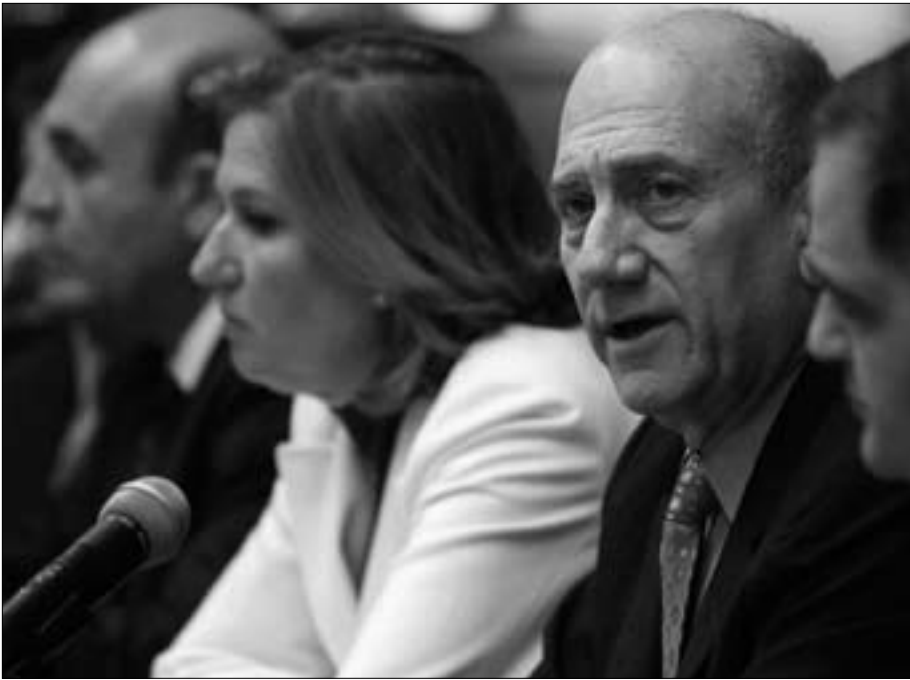
Israel's Foreign Minister Tzipi Livni and Prime Minister Ehud Olmert attend cabinet meeting Nov. 16. Livni, possibly the next prime minister, generally backs withdrawal from lands captured in 1967 under certain conditions.

lished in Britain, shed some light on the prospect of Israel being able to rely on diplomacy to solve the stubborn Iranian situation.