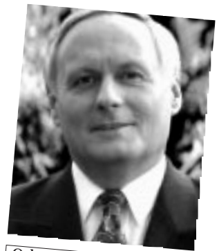
Oskar Lafontaine, German Finance Minister

In recent months a face has risen to new prominence on the European political scene—Germany’s new federal minister of finance, Oskar Lafontaine. Only a few months ago the average man in Europe had probably never heard of him. Now his face is well known on the continent and in Britain.