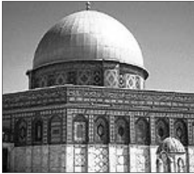
Dome of the Rock in Jerusalem

when. Christ gave them virtually the same answer that He had previously. “It is not for you to know times or seasons which